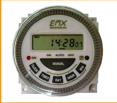
ETM-17 Digital Timer