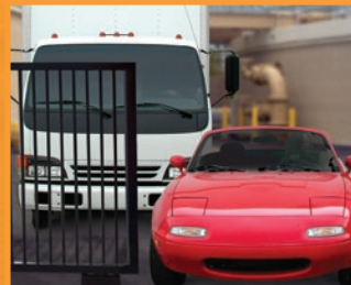
Adjustable Partial Open for different opening distances