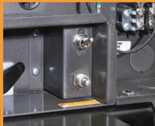
Built In power switch and reset switch