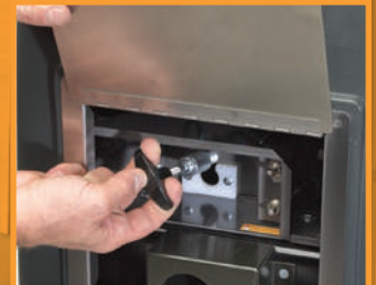
Easy To Use "T-Handle" release