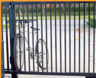
Entrapment Prevention reverses gate when obstructed