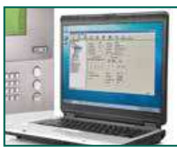
pc programmable easy to use software included