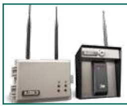
wireless expansion up to 24 entry points