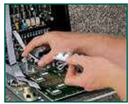
modular easy installation and service