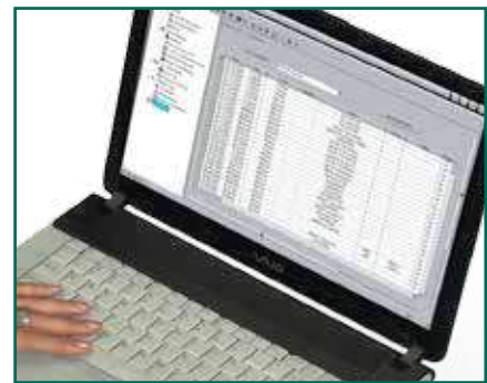
pc programmable Program the 1810 Access Plus from your PC