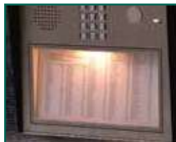
led lighted directory display