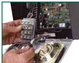
modular design makes installation and service easy