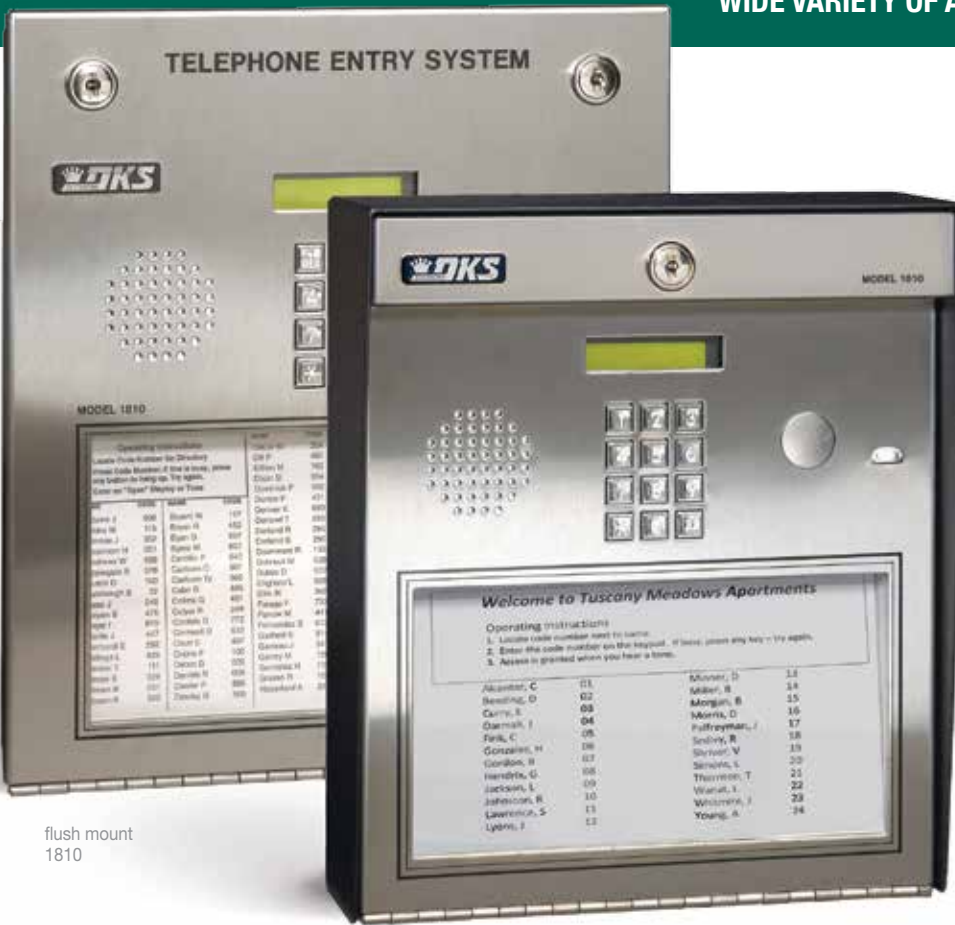
flush mount 1810

THE BUILT-IN DIRECTORY MAKES THE 1810 SUITABLE FOR A WIDE VARIETY OF APPLICATIONS AND IS EASILY UPDATED