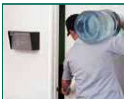
flash entry codes allow entry on a single day only, then automatically deactivate themselves