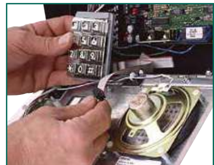
modular design makes installation and service easy