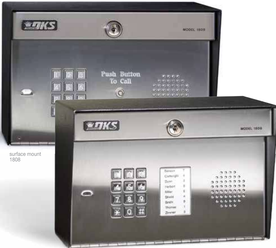
surface mount 1808

IDEAL FOR RESIDENTIAL AND SMALL COMMERCIAL OR APARTMENT APPLICATIONS