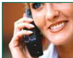
talk to your guest at a front door or gate from any telephone in the house