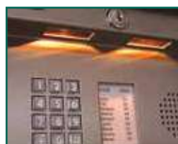
led lighting illuminates keypad and directory