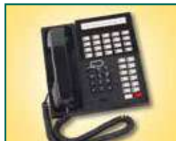
dtmf tone output useable with PBX, KSU and telephone systems with auto-attendants