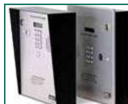
two mount styles surface and flush are available