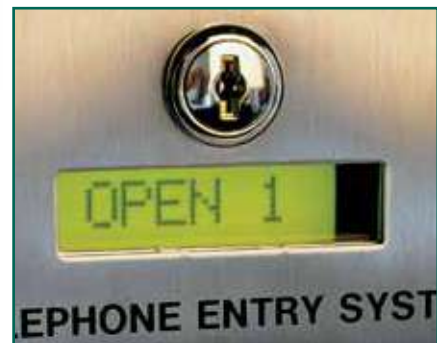
built-in display indicates door/gate has been opened