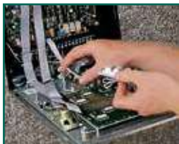
modular design makes installation and service easy