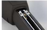
NEW MODERN & POLISHED DESIGN