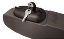
MANUAL KEY RELEASE FOR EASY ACCESS