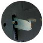
MECHANICAL FOOT PEDAL RELEASE