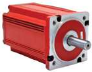
BRUSHLESS DC MOTOR CONTINUOUS DUTY 24V 1HP