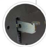
Mechanical Foot Pedal Release