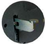
MECHANICAL FOOT PEDAL RELEASE