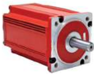
BRUSHLESS DC MOTOR CONTINUOUS DUTY 24V 1HP