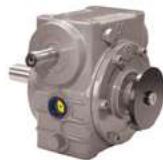
NOW WITH BIGGER INTERNAL DISCONNECT GEARBOX