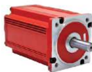
BRUSHLESS DC MOTOR CONTINUOUS DUTY 24V 1HP